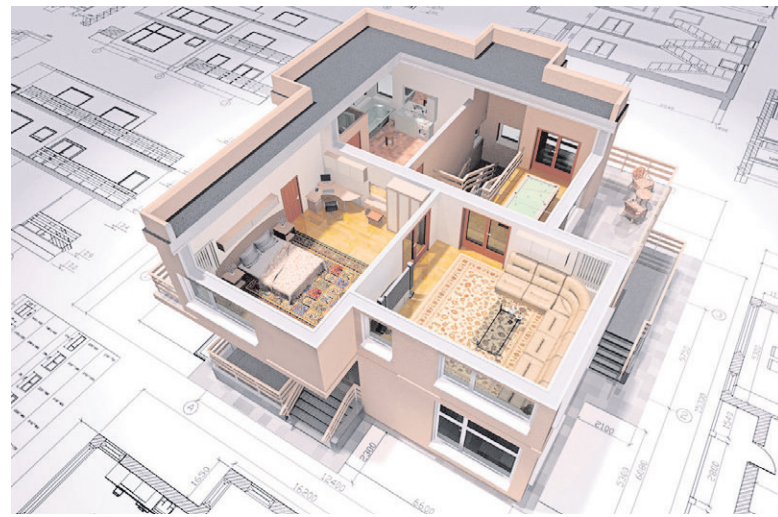
Room planners come in various forms, from free downloads available through popular furniture companies to pay-for-use, third-party software.

These are just a few of the room planners that can make it easier to see what a finished design product may one day look like.