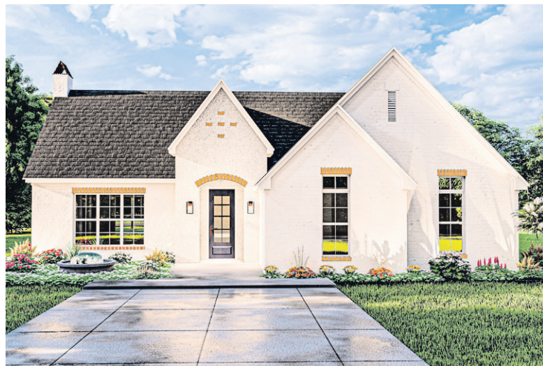
A brick exterior and tall windows deliver stylish curb appeal to this cottage design.

See more images online at: https://www.eplans.com/collection/house-of-the-week