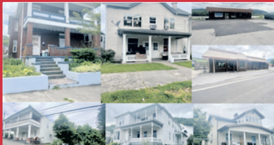
Multiple Parcels in Summers County – Residential & Commercial