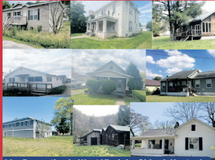
30+ Properties in West Virginia, Ohio, & Kentucky

3 Bedroom, 3 Bath Home TUESDAY, AUGUST 11TH AT 5:00PM 7745 SISSONVILLE DRIVE, CHARLESTON, WV Two Story Home Located Near the Interstate Hardwood Floors, New Windows Screened in Porch Call Blake Shamblin 304-476-7118