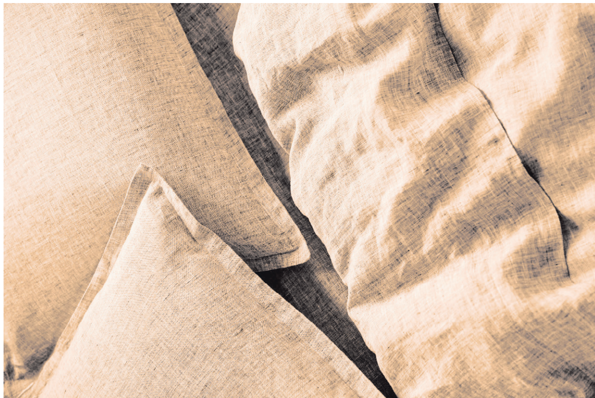
Summer slumber — Linen sheets, like those pictured here, are a summertime favorite, because they are light and breathe. They cost more than cotton sheets, because of the labor involved in harvesting and processing flax, and not everyone likes their texture.

— Linen. Derived from the flax plant, linen is the most breathable sheet fabric.