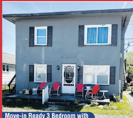
Move-in Ready 3 Bedroom with Workshop

WEDNESDAY, MAY 17TH @ 5PM 114 CRESCENT DRIVE, ST. ALBANS 3 Bedroom, 2 Bath. 3,100+/- Sqft 0.51+/- Acres (as assessed) Two Car Garage with Workspace in the Rear Detached 3 Bay Garage Perfect for Storage Call Blake Shamblin (304) 476-7118