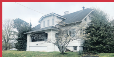
Spacious 5 Bedroom in Charleston Selling to the Highest Bidder