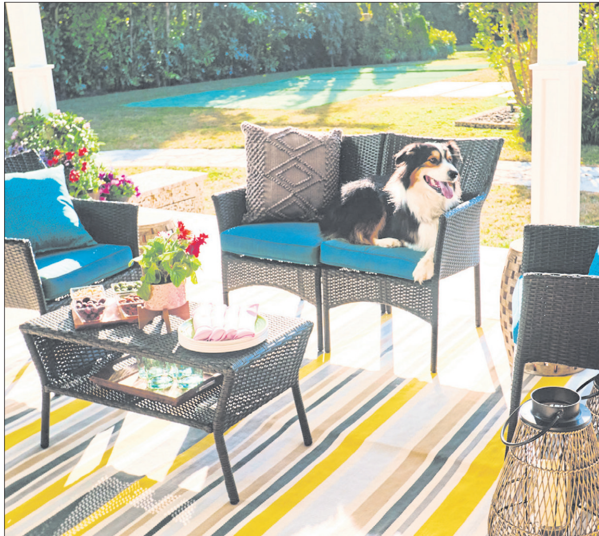
Select outdoor furnishing materials that resist harsh weather conditions, such as those featured on this patio.