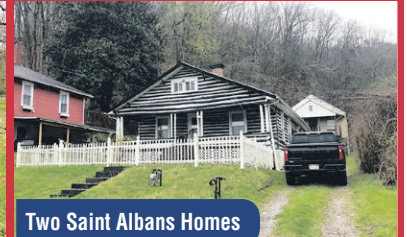
Two Saint Albans Homes

WEDNESDAY, MAY 24TH @ 5PM 625 WOOD RD., CHARLESTON 1.2+/- Acres (as assessed) 3 Bedrooms, 2 Baths 3,858+/- Sqft Built in 1950 Call Tia Wolski (304) 777-3945