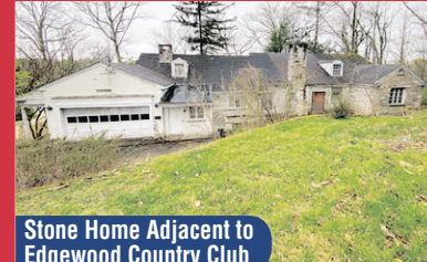
Stone Home Adjacent to Edgewood Country Club

WEDNESDAY, MAY 24TH @ 5PM 625 WOOD RD., CHARLESTON 1.2+/- Acres (as assessed) 3 Bedrooms, 2 Baths 3,858+/- Sqft Built in 1950 Call Tia Wolski (304) 777-3945