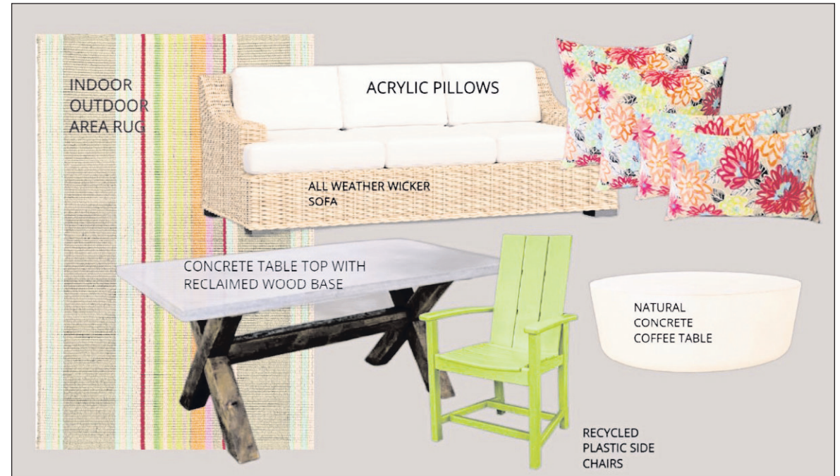
When outfitting your outdoors, be sure to choose furnishings in materials that will stand up to harsh weather, such as those featured on this design board.

lor recommend we get our outdoors warm-weather ready: