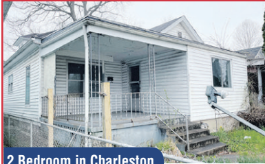
2 Bedroom in Charleston

TUESDAY, MAY 16TH @ 6PM 803 7TH STREET, CHARLESTON ONLINE REAL ESTATE AUCTION 2 Bedroom, 1 Bath. 1,056+/- sqft Built 1925. 0.06+/- Acres (as assessed) Call Keith Hare (304) 741-9135