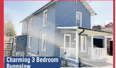
Charming 3 Bedroom Bungalow

TUESDAY, MAY 23RD @ 5PM 1008 OAKMONT RD., CHARLESTON 3 Bedroom, 1 Full Bath 1,214+/- sqft 0.11+/- Acres (as assessed) 1-Car Attached Garage Call Keith Hare (304) 741-9135