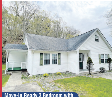
Move-in Ready 3 Bedroom with Workshop

TUESDAY, MAY 23RD @ 6PM 210 CROOKED CREEK RD., SCOTT DEPOT ONLINE ABSOLUTE REAL ESTATE AUCTION Three Bedroom Home with 2 Bath Mobile Home 2 Bedroom with 1 Bath Two Additional Storage Buildings and a Workshop Call Blake Shamblin (304) 476-7118