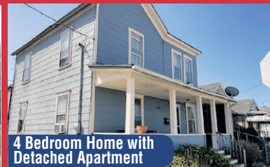
4 Bedroom Home with Detached Apartment

859 CHESTER RD., CHARLESTON 5 Bedroom, 2 Bath 3,356+/- sqft 2- Stall Detached Garage 0.26+/- Acres (as assessed) Corner Lot Call Todd Short (681) 205-3044