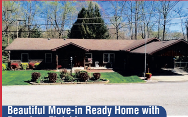
Beautiful Move-in Ready Home with Premium Finishings

TUESDAY, MAY 16TH @ 6PM 803 7TH STREET, CHARLESTON ONLINE REAL ESTATE AUCTION 2 Bedroom, 1 Bath. 1,056+/- sqft Built 1925. 0.06+/- Acres (as assessed) Call Keith Hare (304) 741-9135