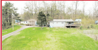
3 Bedroom House and Mobile Home Selling to the Highest Bidder

TUESDAY, MAY 23RD @ 5PM 1008 OAKMONT RD., CHARLESTON 3 Bedroom, 1 Full Bath 1,214+/- sqft 0.11+/- Acres (as assessed) 1-Car Attached Garage Call Keith Hare (304) 741-9135