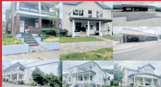
Multiple Parcels in Summers County – Residential & Commercial