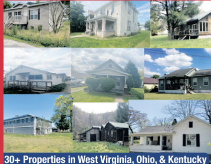
30+ Properties in West Virginia, Ohio, & Kentucky