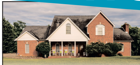
11 Hawkesyard, Charleston $469,900 2:00-4:00 PM