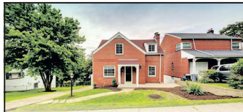
849 Somerset Dr, Charleston $135,000 2:00-4:00 PM