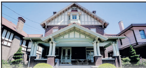
1578 Virginia Street, Charleston $540,000 2:00-4:00 PM