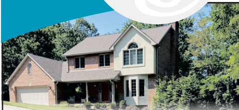
106 Pinnacle Way, Charleston $399,900 2:00-4:00 PM

New price on this Modernistic Home. This 4BR/3.5BA beauty offers a Great Room with stunning Kitchen featuring new quartz countertops & SS appliances. Hardwood floors, 2 gas fireplaces & huge rec room. Double decks & front porch in a serene setting. DIRECTIONS: From the Capitol, up Greenbrier Street, R onto Oakridge Drive. Apx. 1 mile L on Elmont Dr. & L on Pinnacle Dr. R at the "T" & L on Pinnacle Way. House at the end on Left.