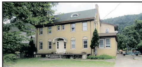
5320 Kanawha Ave., Kanawha City $575,000 2:00-4:00 PM