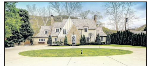
4808 Kanawha Avenue, Charleston $899,900 2:00-4:00 PM

RE/MAX Real Estate Unlimited 1556 Kanawha Blvd., E • Charleston, WV 25311