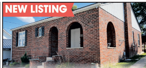
327 Rhoda St, Hurricane $140,000 2:00-4:00 PM

RE/MAX Real Estate Unlimited 1556 Kanawha Blvd., E • Charleston, WV 25311