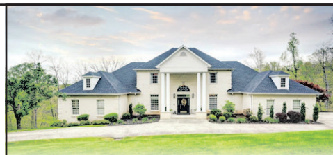
6 Coventry Road, South Charleston $775,000 2:00-4:00 PM