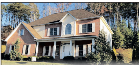
217 Southern Woods Rd., South Charleston $369,900 2:00-4:00 PM

RE/MAX Real Estate Unlimited 1556 Kanawha Blvd., E • Charleston, WV 25311