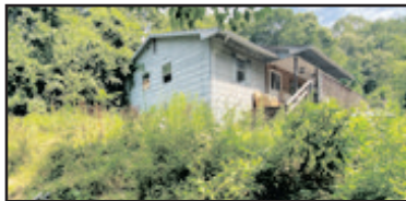
517 Pacific Street – Charleston, WV 4 Bedroom, 2 Bath Home 1,352+/- Sq Ft 0.39+/- Acres (as assessed) District 10, Map 36, Parcel 166

Bidding Ends: Tuesday, September 8th at 6:00 PM • Multi Parcel Auction in Kanawha County