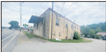
5529 MacCorkle Avenue SW – South Charleston, WV Multi-Use Commercial Building in High Traffic Area, .18+/- Acres (as assessed) 8,460+/- Sq Ft District 18, Map 2, Parcel 1