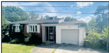
1510 Autumn Road – Charleston, WV 4 Bedroom, 1 Full Bath, 2 Half Baths 1,152+/- Sq Ft Ranch, .62+/- Acres Garage, Gas Heat, Central A/C Great Location to GW High School District 9, Map 21, Parcel 72