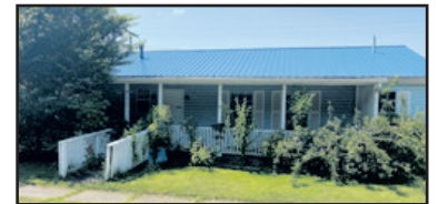
2619 Roosevelt Avenue – Saint Albans, WV 1,837+/- Sq Ft, .12+/- Acres (as assessed) Ranch Style Home District 17, Map 7, Parcel 46