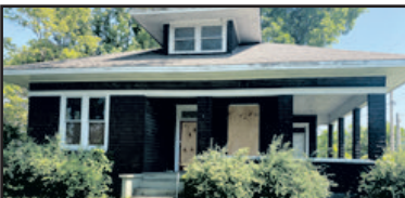
128 Third Avenue – Saint Albans, WV 3 Bedroom, 2 Bathroom, 2,456+/- Sq Ft 0.36+/- Acres (as assessed), Corner Lot – Great Location District 17, Map 1, Parcel 143.1