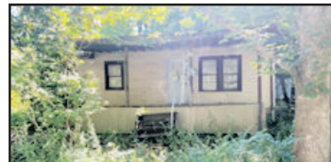
56 Red Oak Drive – Nitro, WV 1,694+/- Sq Ft .17+/- Acres (as assessed) District 25, Map 27A, Parcel 82