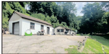
769 Pacific Street – Charleston, WV 1 Bedroom, 1 Bathroom, 752+/- Sq Ft 2.71+/- Acres (as assessed) Garage District 10, Map 33, Parcel 49