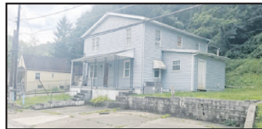
547 Garrison Avenue – Charleston, WV Duplex – 2 Bedroom, 1 Bath Parking for Tenants 0.25+/- Acres District 10, Map 36, Parcel 51