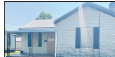
14 Walnut Street – Saint Albans, WV 2 Bedroom, 1 Bath, 770+/- Sq Ft .10+/- Acres (as assessed) Gated Yard, Garage District 17, Map 6, Parcels 41