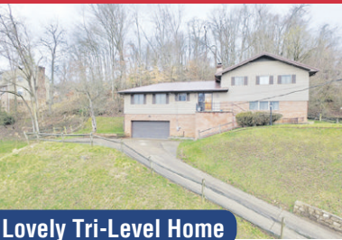
Lovely Tri-Level Home

THURSDAY, APRIL 22 @ 5:00 PM VISCOSE ROAD, PARKERSBURG, WV 144.10 +/- Acres (as assessed) Electric & Gas to Property Wooded Ground - Potential Timber Call Jordan Kiger at (724) 998-5810