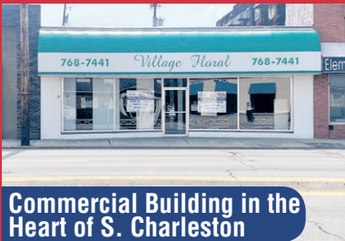
Commercial Building in the Heart of S. Charleston

CALL US TODAY TO SEE HOW WE CAN SELL YOUR PROPERTY IN 6 WEEKS OR LESS!