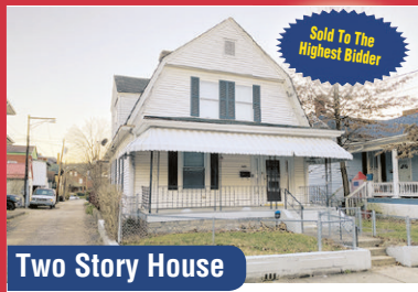
Two Story House

TUESDAY, APRIL 20TH @ NOON 4827 MACCORKLE AVE. SW, SOUTH CHARLESTON 3,200+/- SqFt Commercial Space .09+/- Acre Lot on Highly Traveled Road Call Taylor Ramsey at (304)552-5201