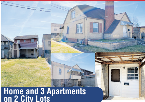
Home and 3 Apartments on 2 City Lots

TUESDAY APRIL 13TH @ 5:00PM 1335 LIGHTNER AVE., DUNBAR