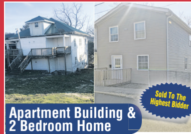
Apartment Building & 2 Bedroom Home

WEDNESDAY, APRIL 14TH 5:00PM AUCTION HELD AT 1217 STUART ST. CHARLESTON