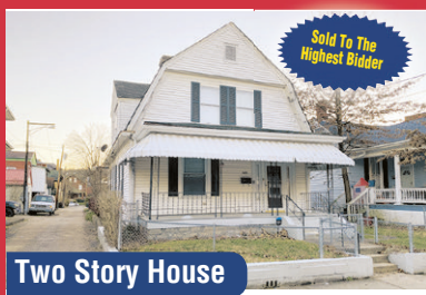
Two Story House