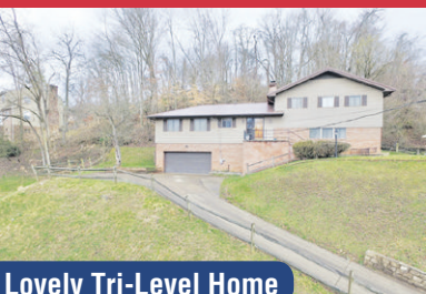
Lovely Tri-Level Home

THURSDAY, APRIL 22 @ 5:00 PM VISCOSE ROAD, PARKERSBURG, WV 144.10 +/- Acres (as assessed) Electric & Gas to Property Wooded Ground - Potential Timber Call Jordan Kiger at (724) 998-5810