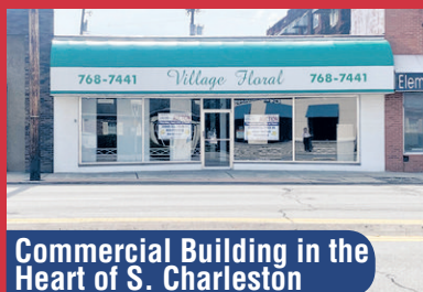
Commercial Building in the Heart of S. Charleston