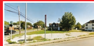
(165730) $150,000 COMMERCIAL Call WG 304-633-3950