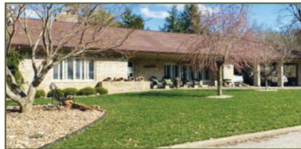
10 Berkley Place