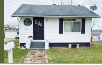
4058 Van Sant Street