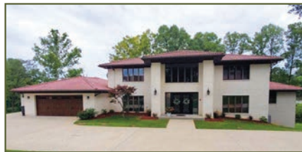
67 Mayfair Way