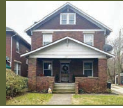
1203 Washington Blvd.