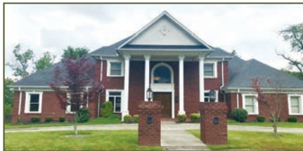
110 Oak Lane