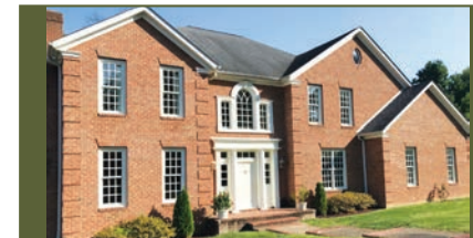
114 Oak Lane