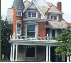
1102 5th Avenue