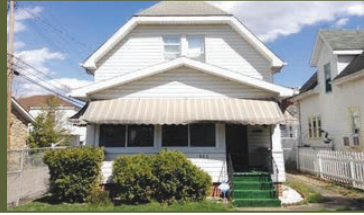
922 24th Street