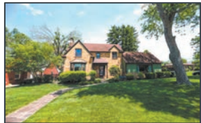
1946 Wiltshire Blvd - $275,000 Huntington, WV 25705 3 BR, 2.5 Ba - 2,786 Sq. Ft.