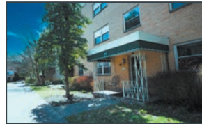
614 11th Ave Apt. 3A - $99,900 Huntington, WV 25701 2 BR, 1 Ba - 1,200 Sq. Ft. Condo