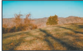
Lt 7 Highland Mdws - $69,900 Huntington, WV 25702 1.07 Ac Res. Lot in Subdivision