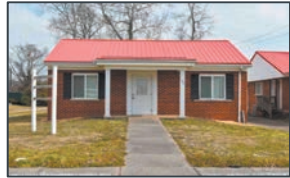
105 River Rd - $1,750/Mo. Barboursville, WV 25504 1,500 Sq. Ft. Space For Lease