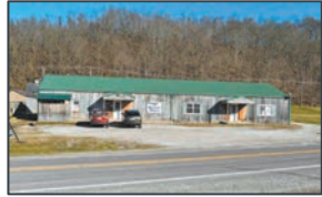
6576 Sanns Dr - $169,900 Lesage, WV 25537 4,200 Sq. Ft. Comm. Property