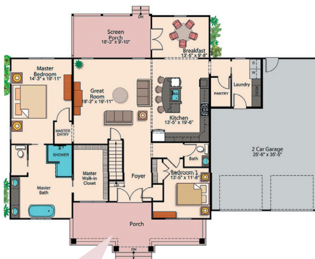
1ST FLOOR LIVING AREA

The Covington (3058 sq. ft.) is a 2-story home with 4 bedrooms, 2.5 bathrooms and 2-car garage. Features include open floor plan, breakfast area, great room, master bed downstairs, walk in closets, and a bonus room upstairs.