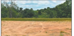
Lt 6A Palisades Dr - $118,900 Barboursville, WV 25504 1.60 Acre Residential Lot