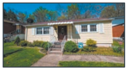
1777 Arlington Blvd - $90,000 Huntington, WV 25705 3 BR | 1 Ba | 1,135 Sq. Ft.