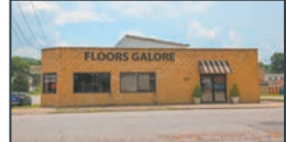
801 Washington Ave - $259,900 Huntington, WV 25704 4,547 Sq. Ft. Commercial Space