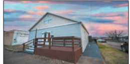
1050 Adams Ave - $99,900 Huntington, WV 25704 2,231 Sq. Ft. Commercial Space