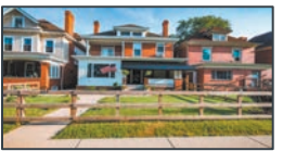
429 6th Ave - $295,000 Huntington, WV 25701 Fourplex