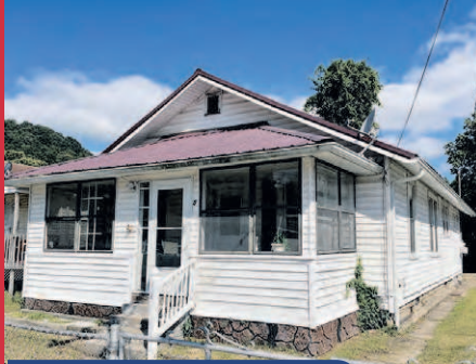
3 Bedroom Ranch in Kanawha City

TUESDAY, JANUARY 3RD @ 4PM 265 58TH STREET SE, CHARLESTON