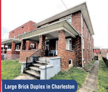
Large Brick Duplex in Charleston

WEDNESDAY, JANUARY 11TH @ 4PM 1513 DIXIE STREET, CHARLESTON