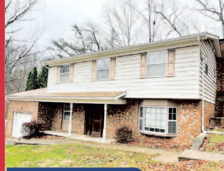
4 Bedroom Home in Dunbar

WEDNESDAY, JANUARY 4TH @ 4PM 103 STEVENS DRIVE, DUNBAR