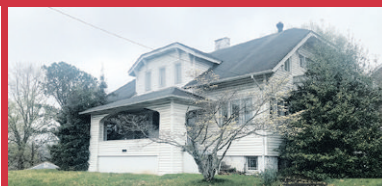
Spacious 5 Bedroom in Charleston Selling to the Highest Bidder