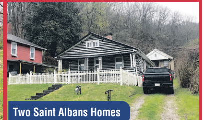
Two Saint Albans Homes

WEDNESDAY, MAY 24TH @ 5PM 625 WOOD RD., CHARLESTON 1.2+/- Acres (as assessed) 3 Bedrooms, 2 Baths 3,858+/- Sqft Built in 1950 Call Tia Wolski (304) 777-3945