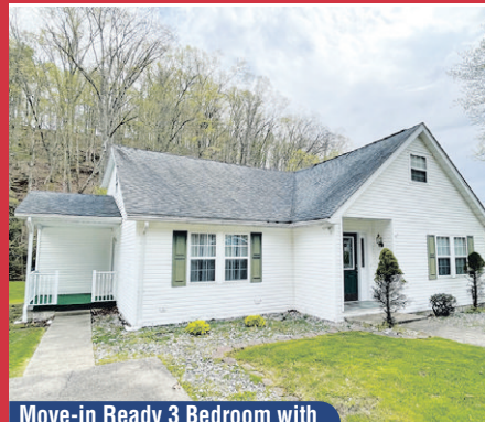
Move-in Ready 3 Bedroom with Workshop

TUESDAY, MAY 23RD @ 6PM 210 CROOKED CREEK RD., SCOTT DEPOT ONLINE ABSOLUTE REAL ESTATE AUCTION Three Bedroom Home with 2 Bath Mobile Home 2 Bedroom with 1 Bath Two Additional Storage Buildings and a Workshop Call Blake Shamblin (304) 476-7118