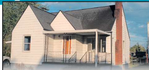
4 Willow Court, Saint Albans $113,500 2:00-4:00 PM