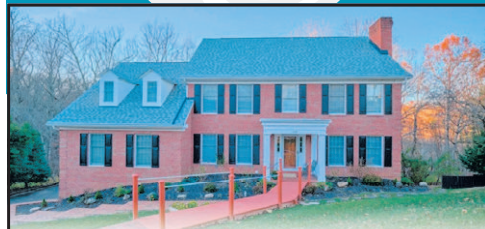
112 E Ridge Rd, Charleston $699,000 2:00-4:00 PM

Spacious traditional brick home in one of South Hills most desired neighborhoods. Open kitchen, casual dining space & separate formal dining room. Formal living area & a family, office/den, & bedroom w/ bath on main level. 4 large bedrooms on 2nd level & 5th bedroom w/ full bath on 3rd level. Lower level offers a finished Rec Room w/ wet bar & tons of storage. Situated on a large, wooded lot, this home offers amazing views from the huge 3-tier decking system, with hot tub & sun room!