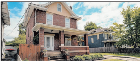
1526 Lee Steet East, Charleston $227,900 2:00-4:00 PM