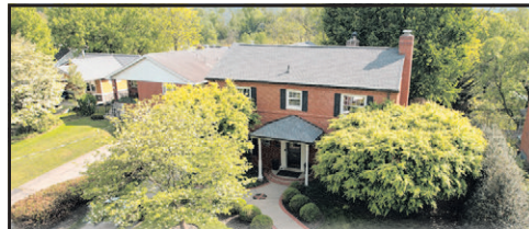
811 Walnut Road, Charleston $399,900 2:00-4:00 PM

Better Homes and Gardens CENTRAL REAL ESTATE Josh McGarth - Broker