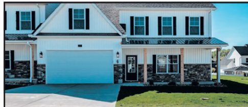
231 Steve Circle, Hurricane $415,000.00 2:00-4:00 PM