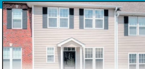
79 Bexley Dr, Scott Depot $274,900 2:00-4:00 PM