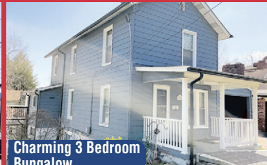
Charming 3 Bedroom Bungalow

THURSDAY, MAY 18TH @ 6PM 112 FAULKNER ST., ST. ALBANS ONLINE REAL ESTATE AUCTION (4) 1 Bedroom, 1 Bathroom Units (2) 2 Bedroom, 1 Bathroom Units $500/Month per Apartment Call Taylor Ramsey (304) 552-5201