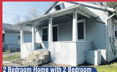
2 Bedroom Home with 2 Bedroom Garage Apartment