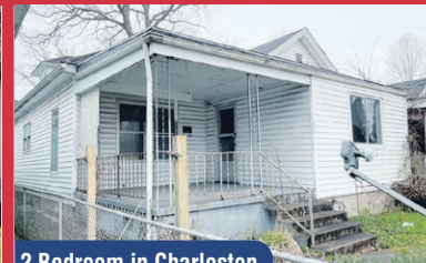
2 Bedroom in Charleston

TUESDAY, MAY 16TH @ 5PM 817 & 819 WOODWARD DR., CHARLESTON Remodeled 2 Bedroom, 1 Bath Home 1,798+/- sqft 2 Bedroom, 1 Bath Garage Apartment 0.262+/- Acres (as assessed) Call Todd Short (681) 205-3044