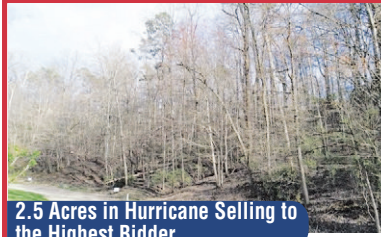
2.5 Acres in Hurricane Selling to the Highest Bidder

WEDNESDAY, MAY 17TH @ 5PM 114 CRESCENT DRIVE, ST. ALBANS 3 Bedroom, 2 Bath. 3,100+/- Sqft 0.51+/- Acres (as assessed) Two Car Garage with Workspace in the Rear Detached 3 Bay Garage Perfect for Storage Call Blake Shamblin (304) 476-7118