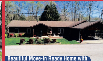
Beautiful Move-in Ready Home with Premium Finishings

TUESDAY, MAY 16TH @ 6PM 803 7TH STREET, CHARLESTON ONLINE REAL ESTATE AUCTION 2 Bedroom, 1 Bath. 1,056+/- sqft Built 1925. 0.06+/- Acres (as assessed) Call Keith Hare (304) 741-9135