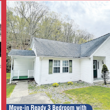
Move-in Ready 3 Bedroom with Workshop

TUESDAY, MAY 23RD @ 5PM 1008 OAKMONT RD., CHARLESTON 3 Bedroom, 1 Full Bath 1,214+/- sqft 0.11+/- Acres (as assessed) 1-Car Attached Garage Call Keith Hare (304) 741-9135