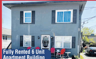
Fully Rented 6 Unit Apartment Building