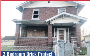
3 Bedroom Brick Project Home in Charleston

MONDAY, MAY 15TH @ 6PM 1409 7TH AVE., CHARLESTON 3 Bedroom, 1 Bath . 1,680+/- sqft Full Basement 0.138+/- Acres (as assessed) Call Todd Short (681) 205-3044