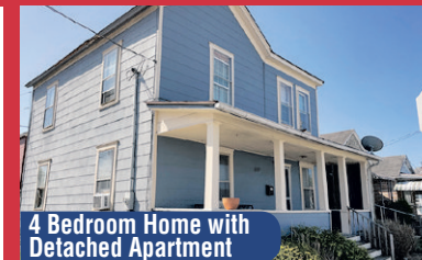
4 Bedroom Home with Detached Apartment

Lot with Building approx.. 32x74 Parking lot approx.. 39x74 Newer Roof & HVAC Rear Private Entrance Security Cameras Call Keith Hare (304) 741-9135