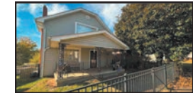
265 Oakland Ave - $65,000 Huntington, WV 25705 3 BR | 2 Ba | 1,356 Sq. Ft.