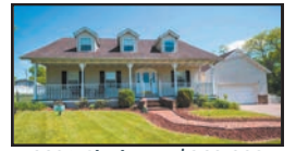
6601 Clark Dr - $362,900 Barboursville, WV 25504 4-6 BR | 4 Ba | 3,697 Sq. Ft.