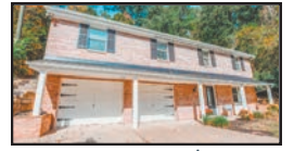
1951 Ritter Blvd - $199,500 Huntington, WV 25701 3 BR | 2 Ba | 1,984 Sq. Ft.