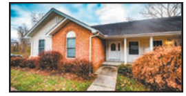
4 Seneca Ct - $210,000 Huntington, WV 25705 3 BR | 2 Ba | 1,638 Sq. Ft.