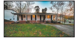
126 Parkway Drive - $160,000 Huntington, WV 25705 3 BR | 1.5 Ba | 1,506 Sq. Ft.