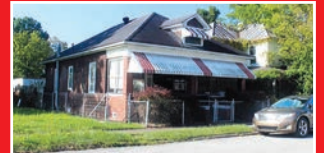
(177146) $50,000 2BR/1BA Call WG 304-633-3950